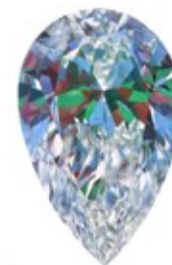
Optical Symmetry Excellent

The colored areas of the symmetry image are indications of light handling ability, giving a visual representation of proportions and facet alignment.